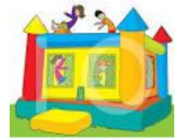
White Ball Illustration © 2008/09